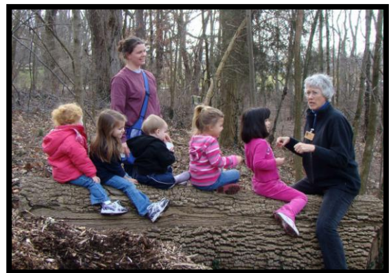
Winter Nature Tots