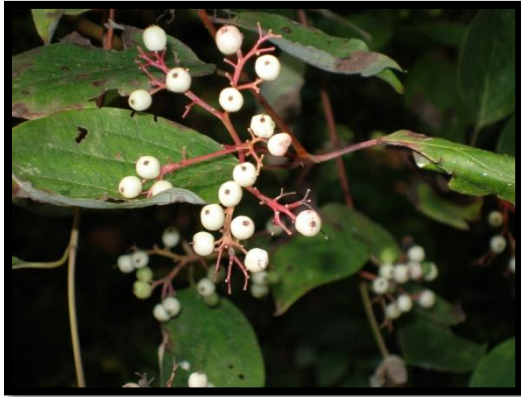
← Red Osier Dogwood