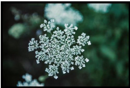
Queen Anne's Lace ↓