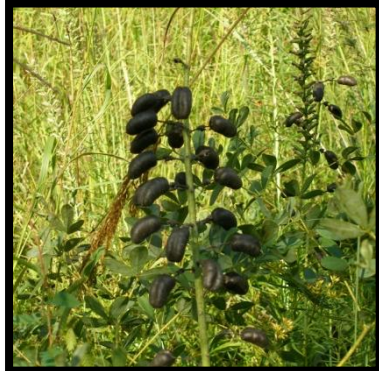
False Indigo Seedpods