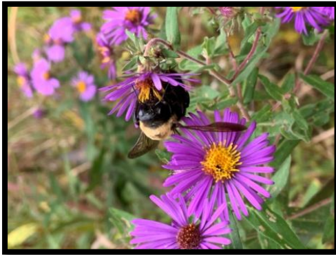
New England Aster

Learn about nature in fall through activities, exploration, crafts and more, and then wrap up your morning with a snack! Sound like fun? Join us to explore nature hands on as the plants and animals get ready for winter beginning in mid-October, from 10-11:30 a.m. Nature Tots is free and includes all four seasons with a 2021 family membership. Geared for children 6 months to 6 years of age, with their caregivers. Reservations (space is limited to 10, may expand to 2 time offerings if interest warrants) and 2021 family membership required. Be sure to dress for the weather, we will be outdoors! Join us for crafts, games, and exploration.