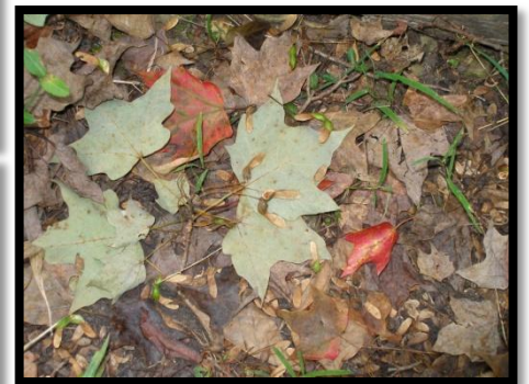
Sugar Maple leaves & seeds ↑