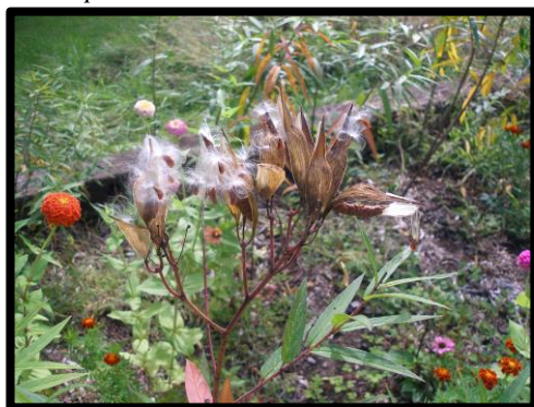
Swamp milkweed seeds