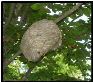
bald hornet nest