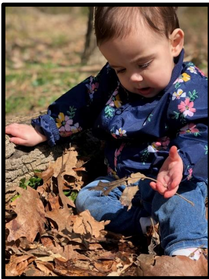
Tot exploring fall leaves