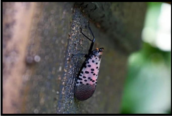
Adult Spotted Lanternfly (Lycorma delicatula)

Nature is full of beauty in many forms. Nature also weaves an intricate ecological balance in ecosystems, with different species co-habiting with others. But this balance goes awry when certain species get thrown into a new ecosystem, accidentally or intentionally, where they are not balanced, thus causing harm as an invasive.