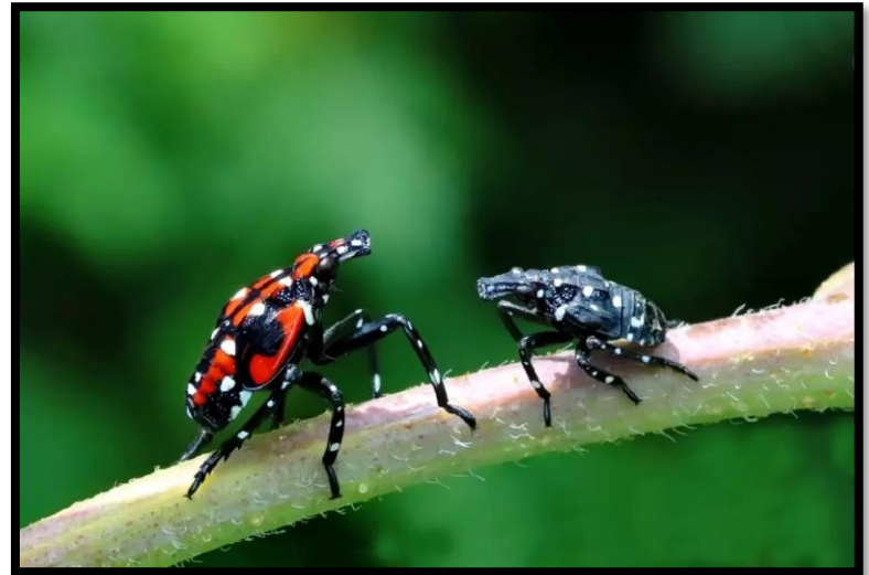
Spotted Lanternfly Instars

Black sooty mold around the base of plants or oozing sap may indicate the presence of the spotted lanternfly. Beginning in October through the beginning of winter, SLF lay their eggs. The egg masses are small and grey, protected by a waxy covering.