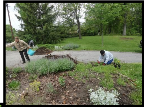
Butterfly Garden →