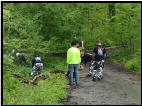
← Work Day Volunteers - FastTrax