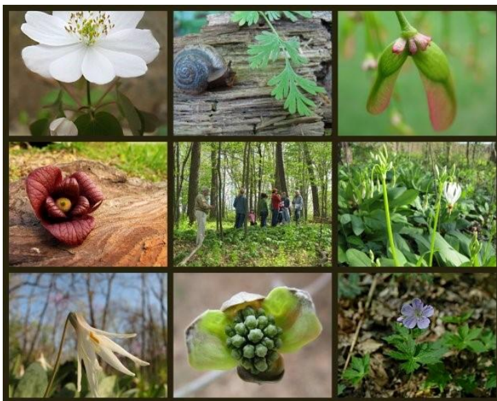
Collage of Spring Wonders.

23 Work Day 9:30-1:00 Volunteers needed to help with mulching the trails and plant care.