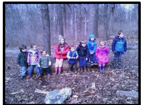
Winter Nature Tots