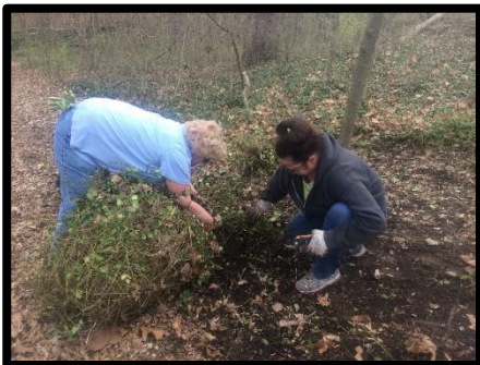
Spring Work Day removing Winter Creeper