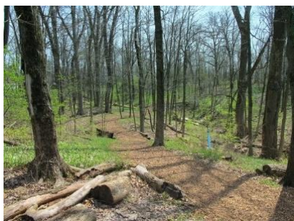
Forest understory in early spring

Bull's Run Nature Sanctuary and Arboretum is reawakening to a new growth season. The spring