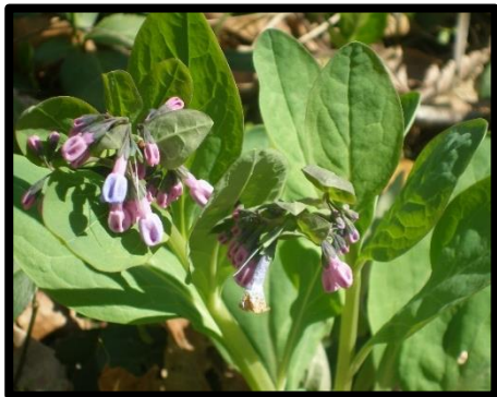
Color along the trails as spring wildflowers bloom.