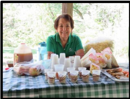
Fall Family Fest Refreshment volunteer