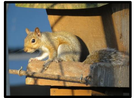
Bird Feeders attract Squirrels, too