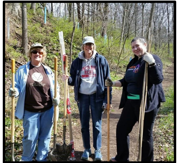
Volunteers at work day help maintain trails and plant seedlings

2018 Membership Form is included in this mailing at the bottom of page 5 and is also available on the website, if you have not already sent in your contribution.