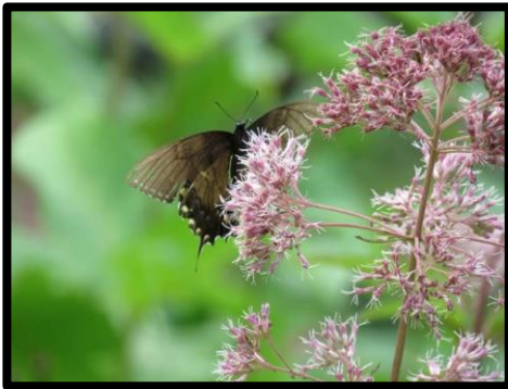
← Female Tiger Swallowtail on Joe Pye Weed