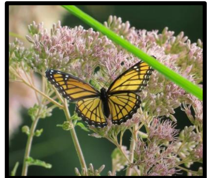
→ Viceroy on Joe Pye Weed

Volunteers for Work Days Are Always Welcome!