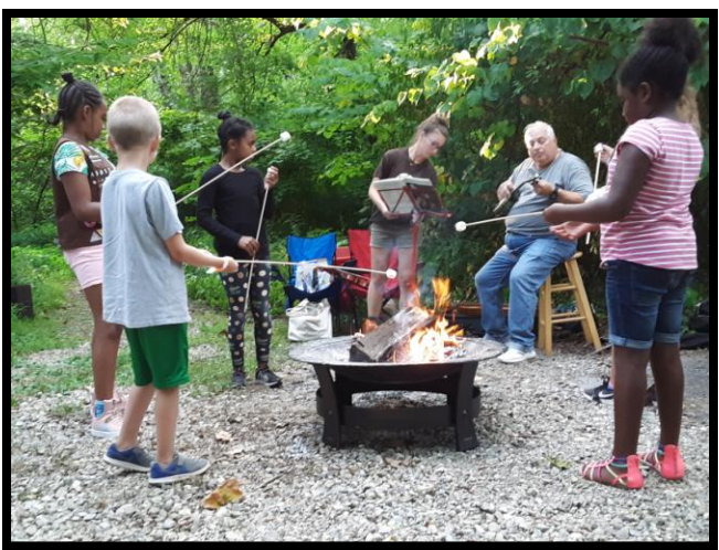
National Night Out at Smith Park