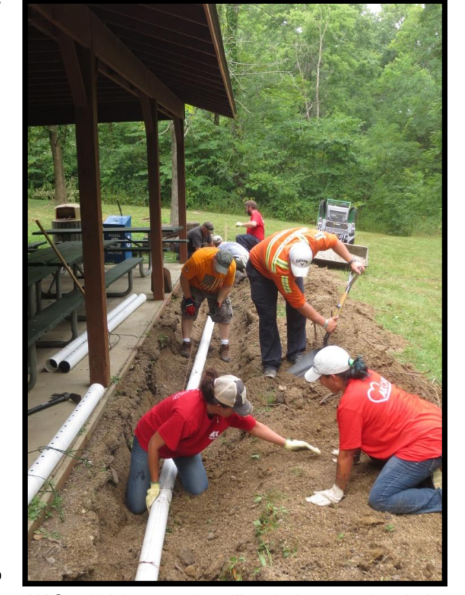
AK Steel Volunteers installing drainage at the shelter