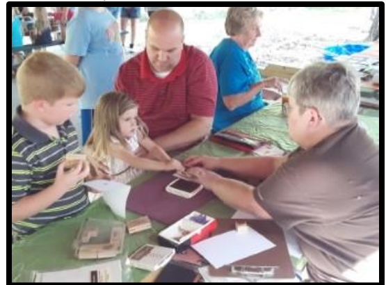
Fall Nature Tots With MidPointe BookMobile