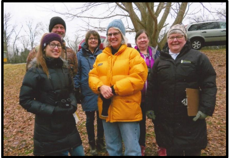
2018 Christmas Bird Count

Saturday, Feb. 22, 10 a.m.-12 p.m., Maple Sugar Hike @ BRNSA