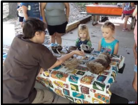
Fun at Fall Family Fest ← ↙ →