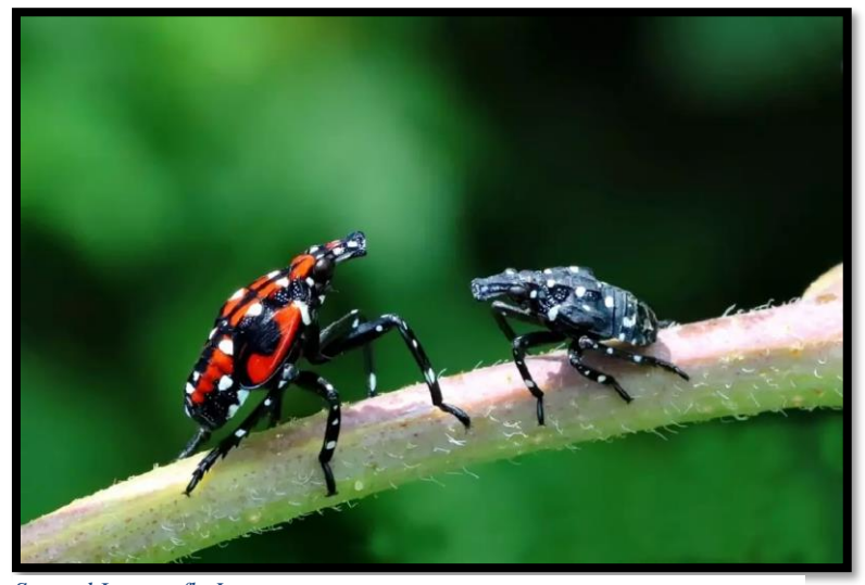
Spotted Lanternfly Instars

Black sooty mold around the base of plants or oozing sap may indicate the presence of the spotted lanternfly. Beginning in October through the beginning of winter, SLF lay their eggs. The egg masses are small and grey, protected by a waxy covering.