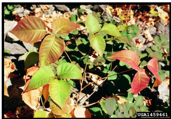
Poison Ivy

The mornings are feeling crisp now, foretelling of the cooling temperatures around the corner. Soon the colors will start to turn, heralding migration season for some and winter sleep preparation for others. We see the yellow and purples of late summer give way to the more earthy reds and fiery oranges. This turning can help identify some of our forest plants that we may wish to avoid, such as poison ivy ( Toxicodendron radicans ). But others like Virginia creeper ( Parthenocissus quinquefolia ) are also shading into red.