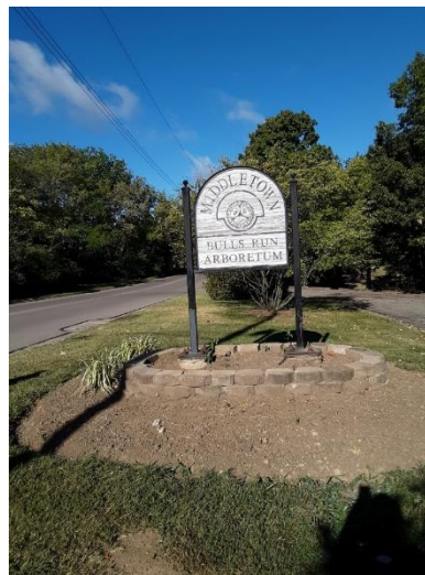
Newly planted entrance sign courtesy of Middletown Garden Club