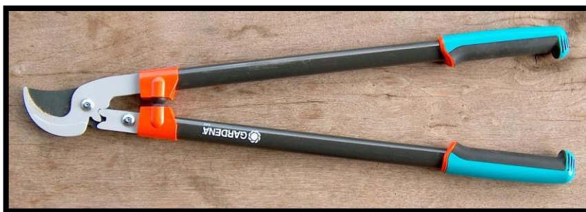
Tree loppers

March 22 April 5 April 26 Earth Day Work Day! May 3 May 17