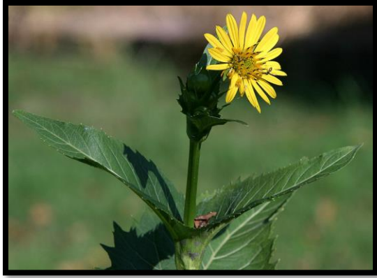
Prairie Cup Plant