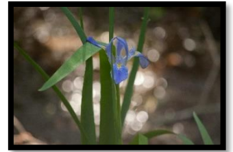
Blue flag iris

Bull's Run Nature Sanctuary and Arboretum is a non-profit volunteer organization located in NE Butler County and serving the surrounding community. We are dedicated to preserving the natural area of Bull's Run and strive to develop the park as an environmental facility and educational resource for people of all ages.