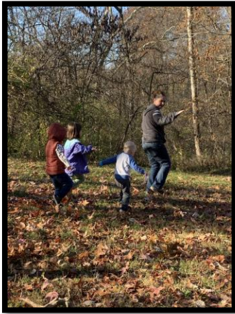
Nature TOTS flying like birds