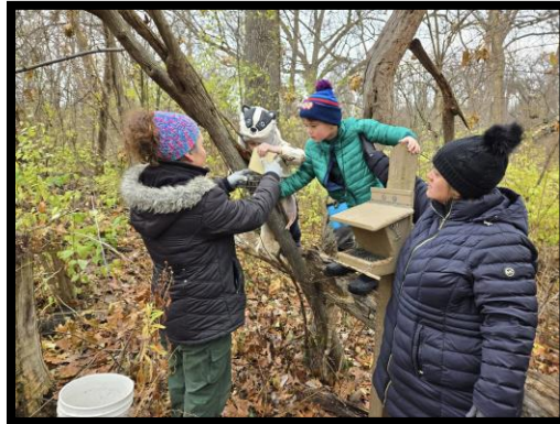
Nature TOTS filling bird feeders